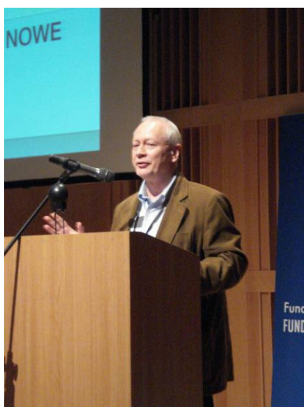
Secretary of State Michał Boni addresses the Gdańsk Social Economy Conference

EQUAL has laid the groundwork for a new ‘economy of solidarity’, the Gdańsk Social Economy Conference heard. At the end of June in the presence of Lech Walesa, the event reviewed the programme’s results, launched Poland’s Social Economy Manifesto, and laid plans for transnational work in coming years.